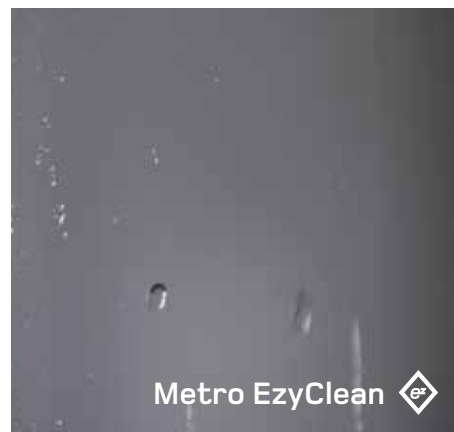
Metro EzyClean ®

Applied in our state-of-the-art manufacturing facilities, Metro's unique EzyClean Technology ® provides a protective coating that creates a long lasting, invisible shield on your homes glass surface.