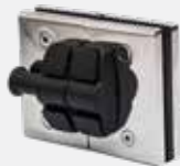
MALIBU GATE LATCH