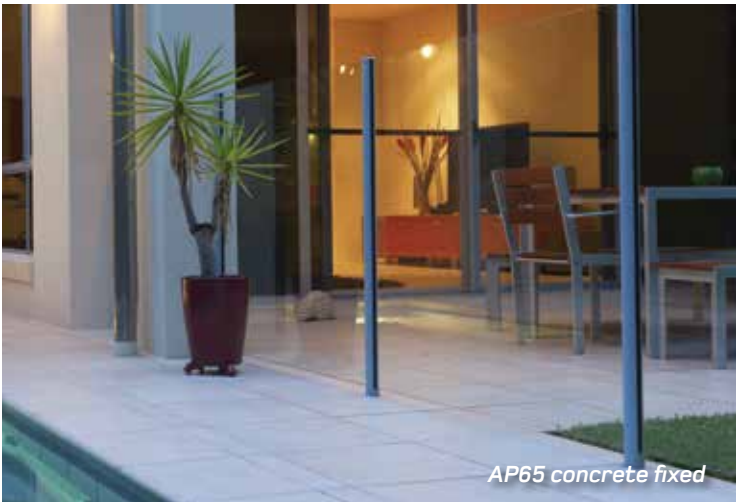
Cover Image: Base Fix Mini Post