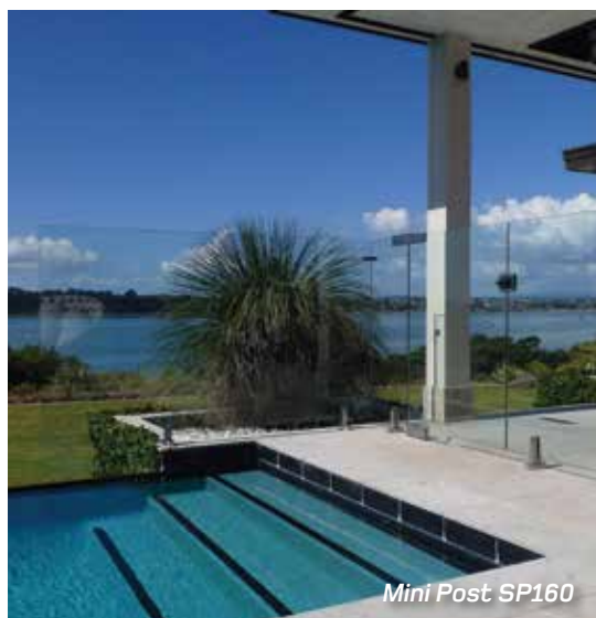
Mini Post SP160