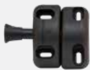
MAGNA GATE LATCH