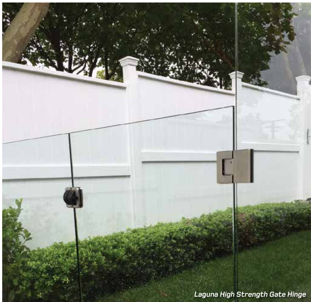
Laguna High Strength Gate Hinge