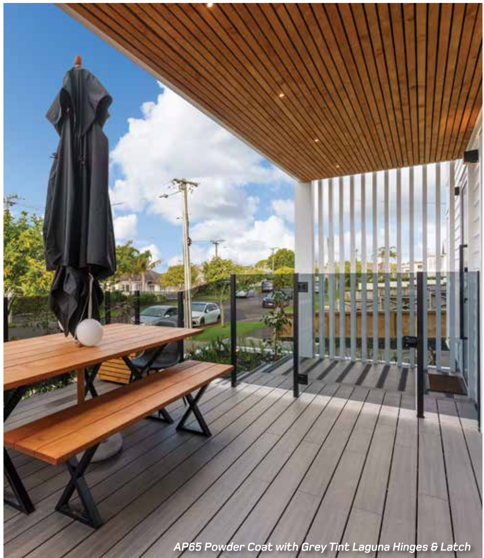
AP65 Powder Coat with Grey Tint Laguna Hinges & Latch