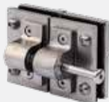
OZONE GATE LATCH