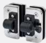
POOL GATE LATCH