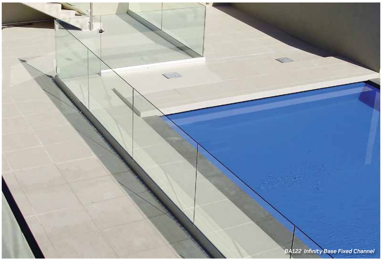
BA122 Infinity Base Fixed Channel