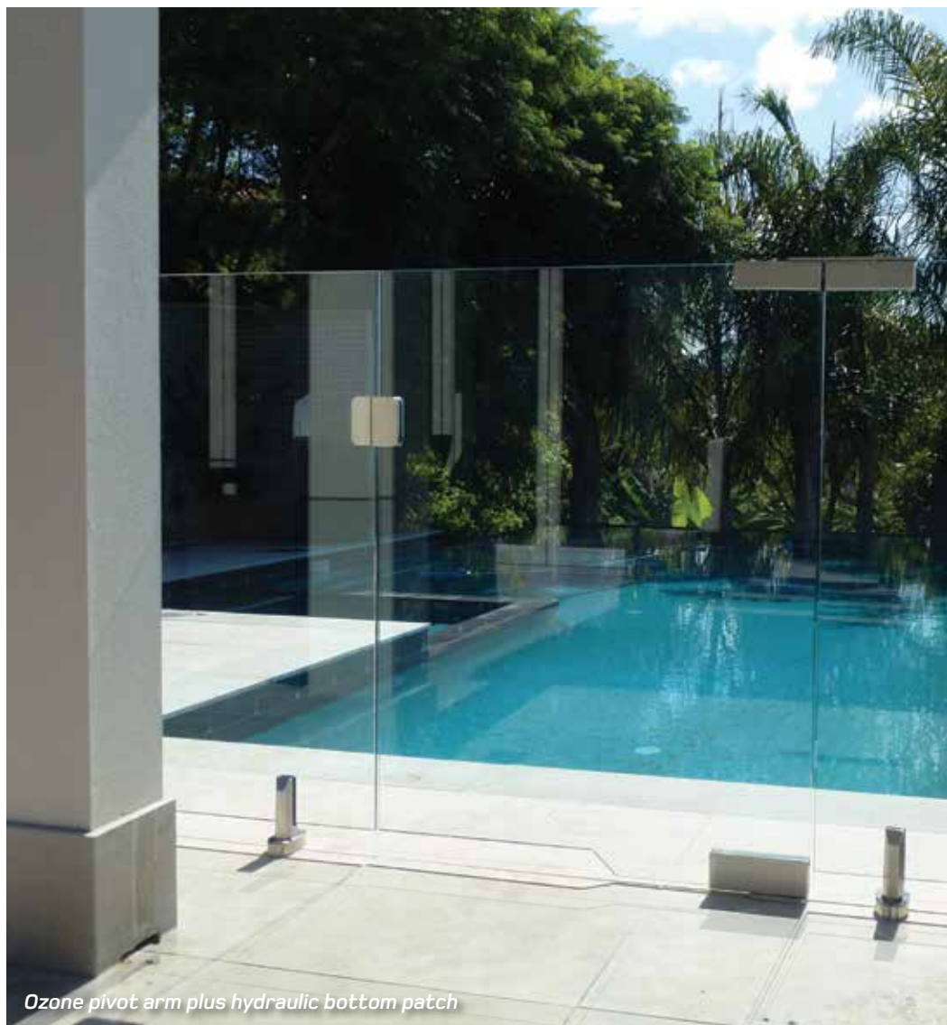
Ozone pivot arm plus hydraulic bottom patch