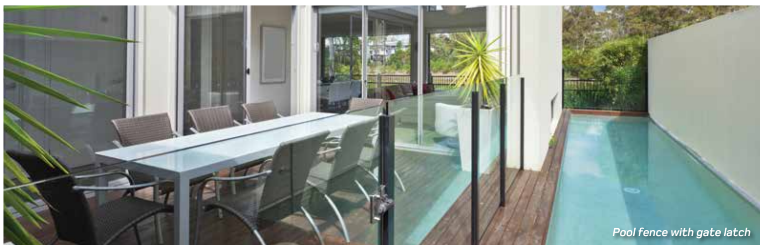
Pool fence with gate latch

Note: Gate latches shown as glass to glass option, others available by request. Ozone Hydraulic Self closing mechanism shown on the back page.