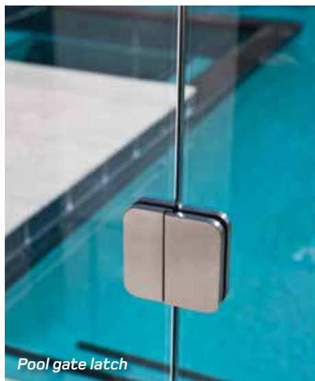
Pool gate latch