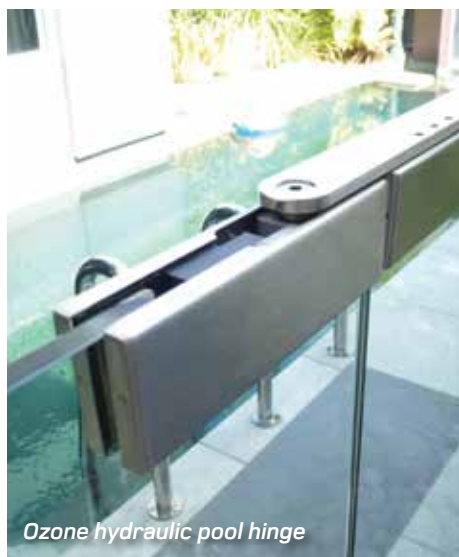
Ozone hydraulic pool hinge