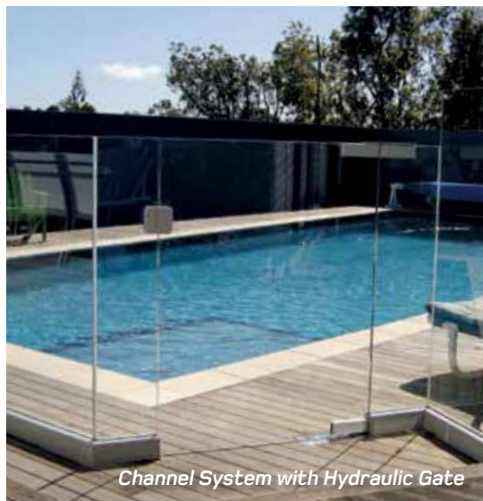
Channel System with Hydraulic Gate