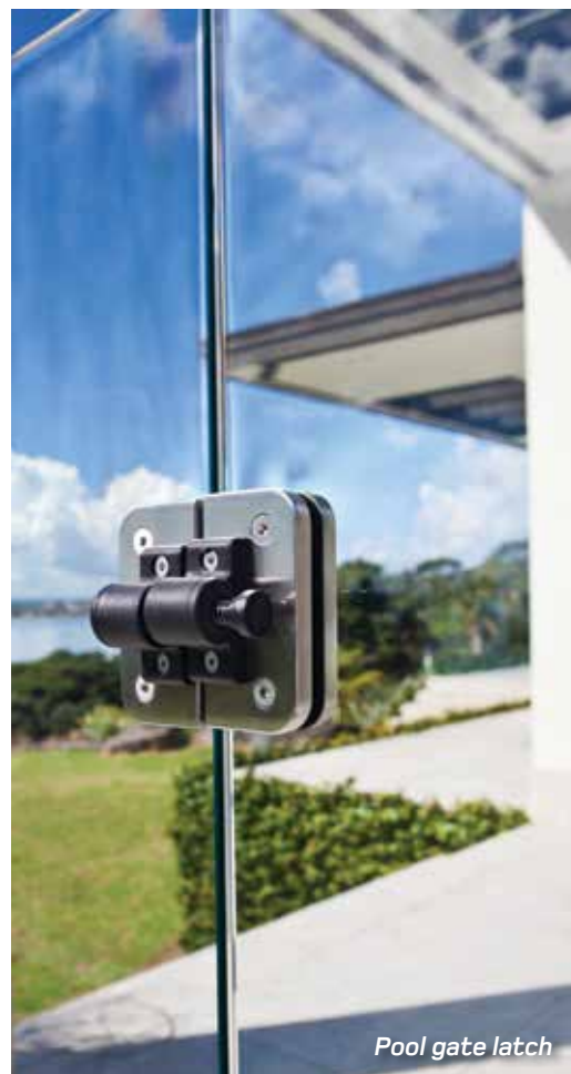
Pool gate latch